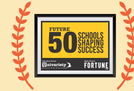
One of the Future 50 schools of India, 2018-19 & ISO 9001:2015 CERTIFIED Seth Anandram Jaipuria School, Kanpur