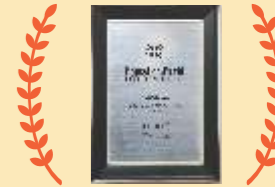
Ranked No. 2 in Kanpur and No. 3 in UP by Education World, 2020-21 Seth Anandram Jaipuria School, Kanpur