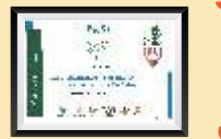
Inspiring Climate School Award, 2019 Seth Anandram Jaipuria School, Lucknow