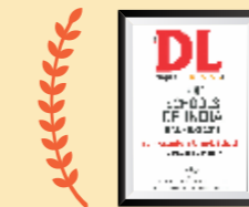
Ranked No 1 in Ghaziabad by Digital Learning, 2019 Seth Anandram Jaipuria School, Ghaziabad