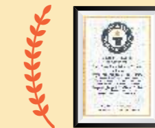
Recognition by GUINNESS BOOK OF WORLD RECORDS, 2019 Seth Anandram Jaipuria School, Lucknow