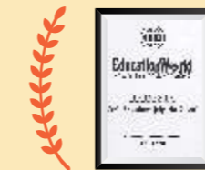
Ranked No 1 in Ghaziabad by Education World, 2020-21 Seth Anandram Jaipuria School, Ghaziabad